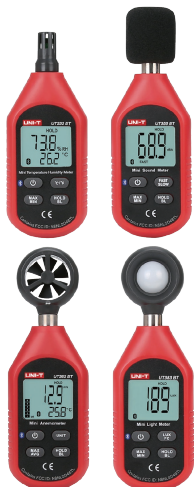
Mini Environmental BT Series