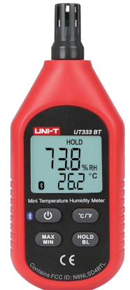
● UT333 BT